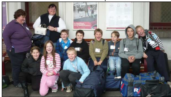
Pictured Above: Some of the group before they met up with the others at Ballarat Train Station to travel to Canberra.

Mrs Overall has reported all the students are having an enjoyable experience at the Canberra Camp.